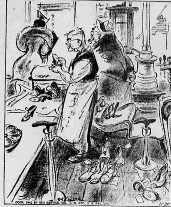
"Guess war is a great leveler—soon as she grew up she said her feet were so delicate she couldn't wear re-soled shoes, but she wears them now and likes it!"