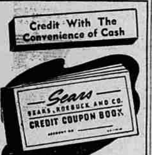
$25 To Spend Right Now ONLY $5 DOWN

If your dealer is out for the duration, advertise for a used one in the want-ads.