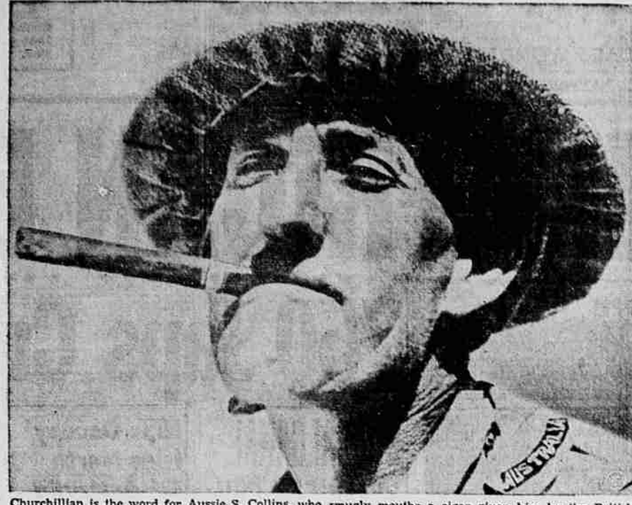
Churchillian is the word for Aussie S. Collins, who smugly mouths a cigar given him by the British Prime Minister when he visited the Egyptian desert front. Unsmoked, the stogic will be put in a glass case to be handed down as a family heirloom. (Passed by censor.)