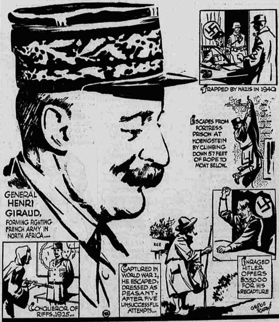
GENERAL HENRI GIRAUD, FORMING FIGHTING FRENCH ARMY IN NORTH AFRICA...