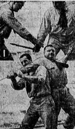
NEXT: Defense against choking hold.

Assailant thrusts a knife at your abdomen (1). Turn your body to the right. Grasp assailant's wrist and continue his forward motion. Throw his knife-wielding arm over your left shoulder into a flying mare with palm up (2). This easily breaks assailant's arm at the elbow.