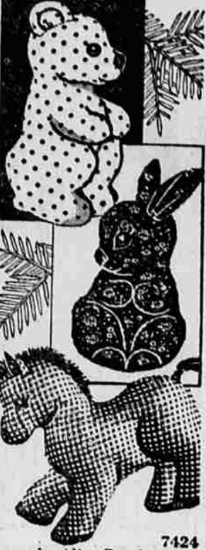
7424 by Alice Brooks

Start these now to have them ready in plenty of time to put into some tot's stocking. They're toys the smallest budget can handle for they use so little material. Pattern 7424 contains a transfer pattern and instructions for making 3 toys; illustrations of stitches; materials needed.