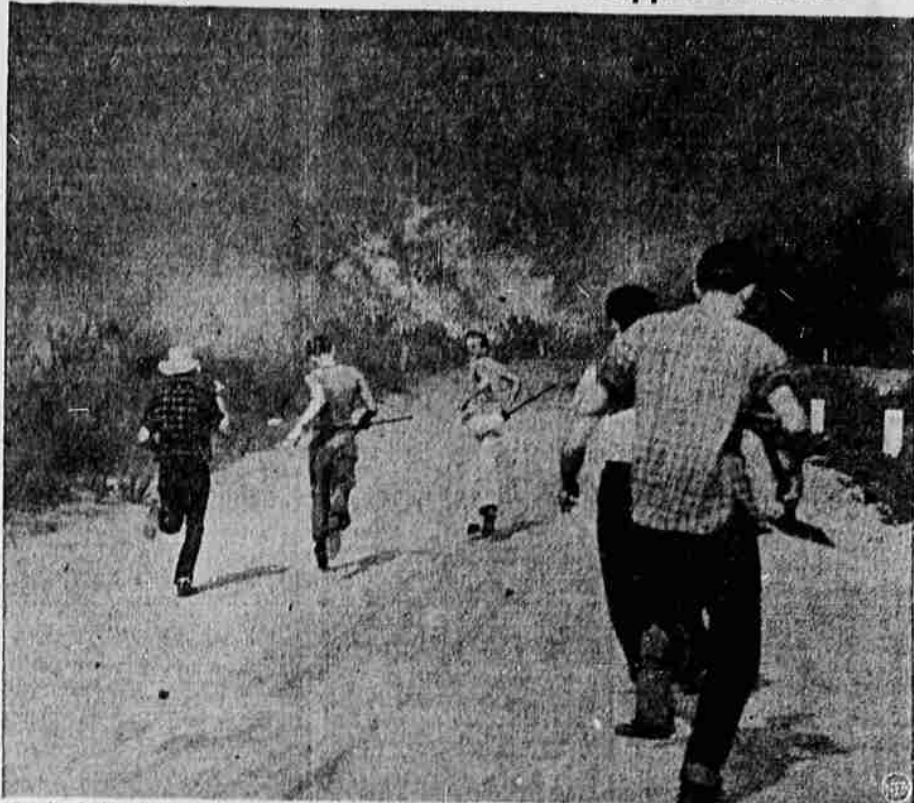
On the double, firefighters and spectators armed with shovels dash to the rescue of a group of men trapped by the wall of flame and smoke which suddenly jumped this road, cutting off escape from the big brush fire sweeping the Santa Monica mountains near Los Angeles.

sition since replacement parts can be made for all types of scales besides those used strictly in the home.