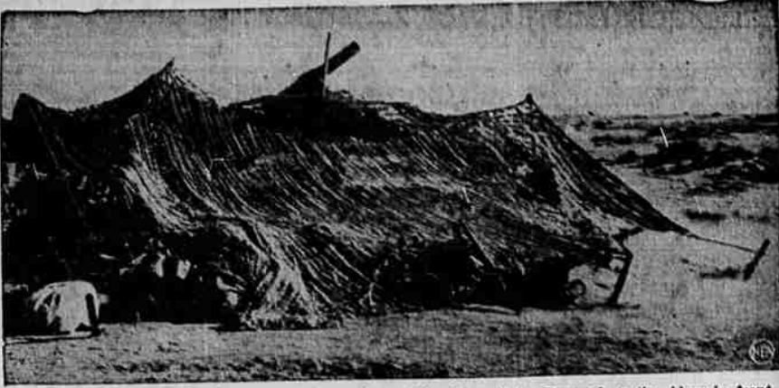
Camouflaged British medium artillery piece, shown lying in wait for Rommel on the Alamein front, helped United Nations tank forces stop the Afrika Korps' recent drive for Egypt. (Passed by censor.)