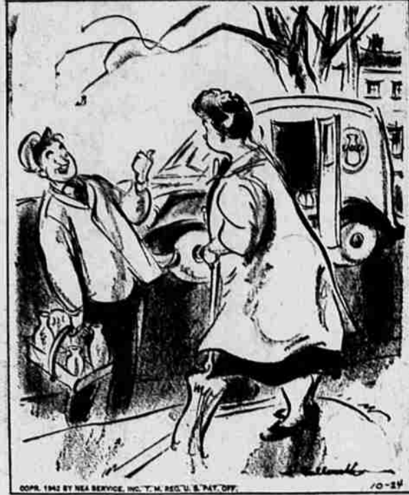
"Yes, I'll soon be driving an Army truck—and what a relief it will be to be going some place instead of driving up and down the same streets every day!"

er and fewer attempts to conceal their displeasure at not getting more aid. A story, possibly apocryphal, is being told around town and attributed to them, sometimes to Stalin. It is said Stalin has thought the matter over thoroughly, and reached the conclusion there are two ways for him to get enough aid to win. One a natural way and the other a supernatural way. The natural way would be for the Angel Gabriel, who is charged with the ministrations and comfort of man, to descend from the heavens and disperse the Nazi armies. That would be natural enough. The supernatural way would be for Winston Churchill to "keep his promise and establish a second front." It is at least reflective of Russian official viewpoint.