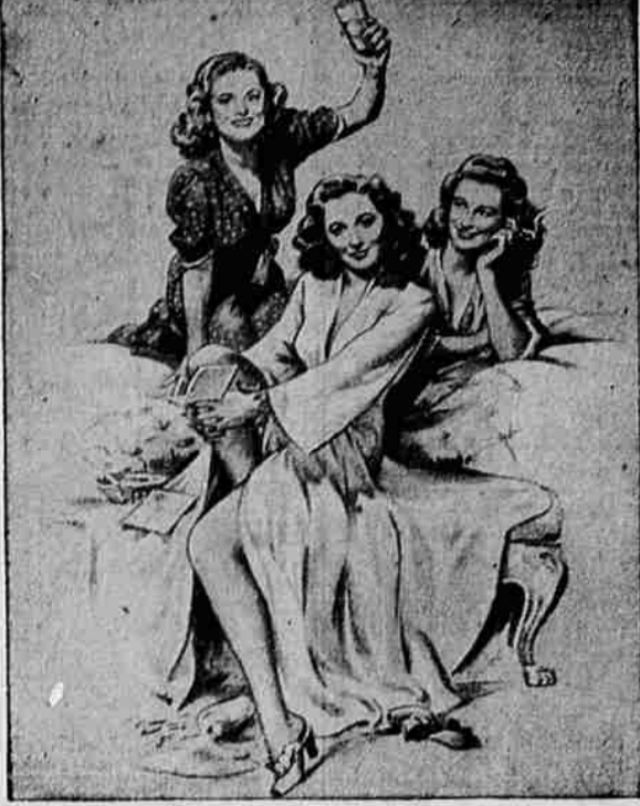
Above—An artist's impression of Barbara Stanwyck, Nancy Coleman and Geraldine Fitzgerald as they appear in "The Gay Sisters" . . . the current attraction at the Esquire theatre. George Brent has the leading male role.