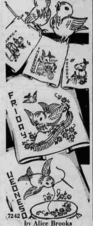
Bluebirds are the symbol of happiness—a lovely thought for your gift tea towels to convey. All the stitches are easy to do in bright floss. Make a set or just a pair of towels. Pattern 7242 contains a transfer pattern of 7 motifs averaging 5 1/2 x 6 1/2 inches; illustrations of stitches; materials needed.

To obtain this pattern send 11 cents in coin to The Herald and News, Household Arts Dept., Klamath Falls. Do not send this picture, but keep it and the number for reference. Be sure to wrap coin securely, as a loose coin often slips out of the envelope. Requests for patterns should read, "Send pattern No. _____, to _____ followed by your name and address.