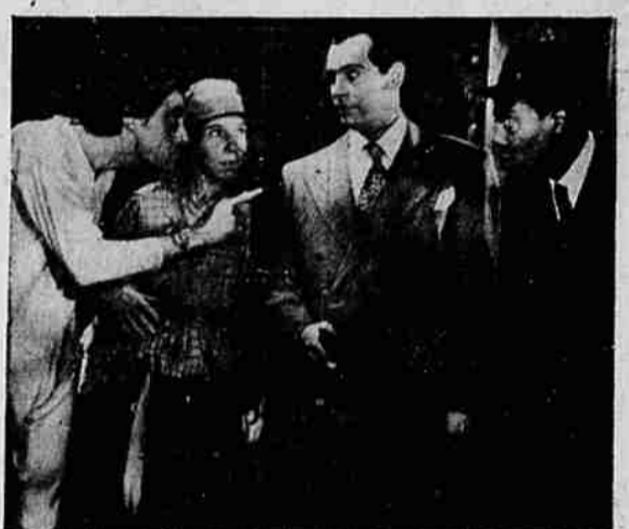
A spooky scene from a spooky picture, "Whispering Ghosts," starring Milton Berle, Brenda Joyce and John Carradine, which is the first half of a double feature opening tonight with a midnight prueve at the Pelican theatre. "Calling Dr. Gillespie" is the companion attraction.