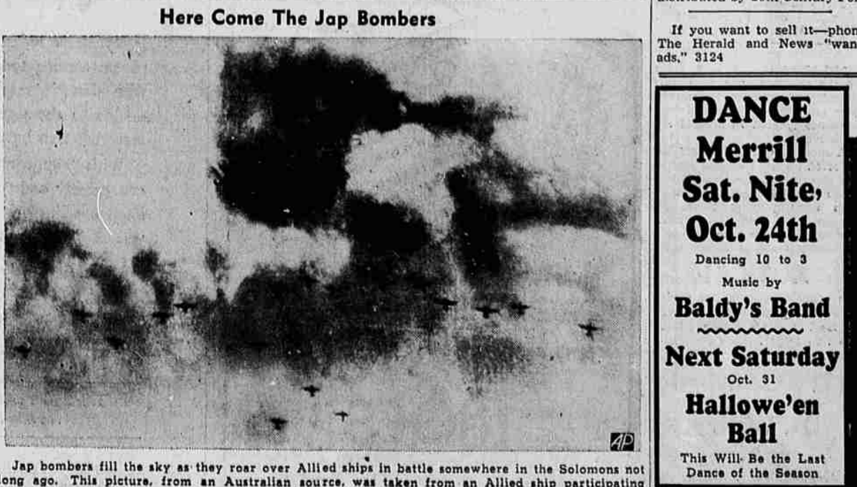
Here Come The Jap Bombers Jap bombers fill the sky as they roar over Allied ships in battle somewhere in the Solomons not long ago. This picture, from an Australian source, was taken from an Allied ship participating in the battle.