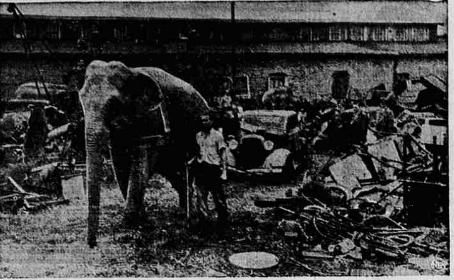
Even the elephants were pressed into service to put the scrap drive across in Norfolk, Va., we seven "ponderous pachyderms" dragged aged jaloppies, which could not navigate under their power, off to the scrapyard.