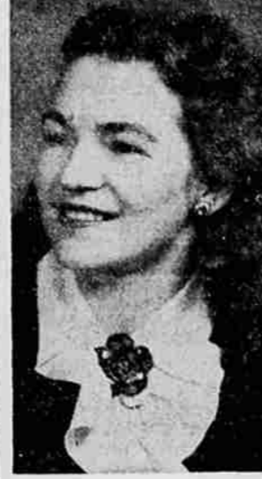
OFFICERS OF KLAMATH BPW