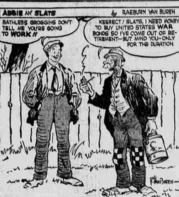
U.S. Treasury Dept. —Courtesy United Features Syndicate.

Recognizing unusual navy aid and cooperation with army air forces in the Aleutians, Maj. Gen. Simon Buckner has awarded the army air medal to three navy officers and a navy radio operator. Two of the four men were lost in action. She said she was blonde, six feet tall in high heels and—charming. Ensign Reuben N. Smith, Garden City, Kansas, went as an observer on day and night flights during icing conditions in the western Aleutians.