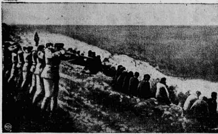
A long line of captured Soviet civilians hunch down on the lip of their own mass grave waiting for the haul of Nazi lead in their backs. The picture was found on the body of a German officer. (Passed by censor.)