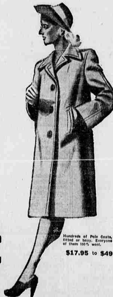
Hundreds of Polo Coats, fitted or boxy. Everyone of them 100% wool. $17.95 to $49