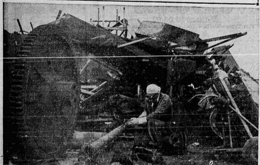
Enough old metal to provide the scrap necessary to build two 35,000-ton battleships has been gathered by GM "waste wardens" since the first of the year. Including the flow of production scrap from metal finishing machines, the total haul from GM's intensive scrap drive amounts to 531,000,000 pounds of iron, steel, copper, aluminum and other metals essential to the war effort. Pictured above is a scrap pile at one of GM's 99 war plants. A worker is engaged in cutting up the large pieces with torch prior to shipment.