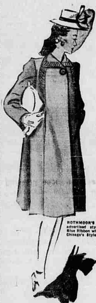
ROTHMOODER coat in most advertised style—The Blue Ribbon winner of Chicago's Style Show. $45