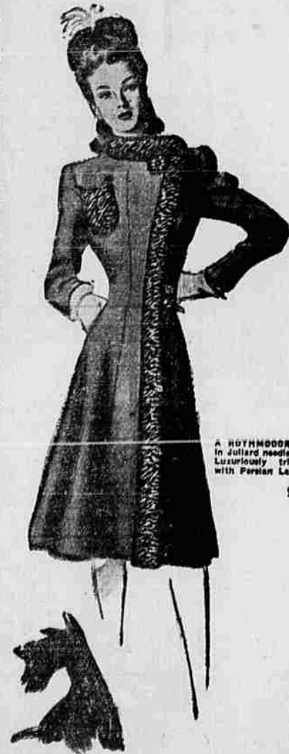
A ROTHMOODER coat in Julliard headquarters. Luxuriously trimmed with Persian Lamb. $49