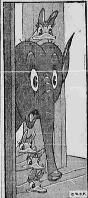
WALT DISNEY'S "FANTASIA" In Technicolor Opens SUNDAY at the Pelican

Surprise! Walt Disney's extraordinary new feature, "Fantasia," is filled with surprises, since it is unlike any other motion picture ever made. "To describe it is impossible," wrote the critic for Esquire Magazine, "you must see it." The characters here are from the burlesque ballet which will forever make you slightly tipsy about toe-dancing.