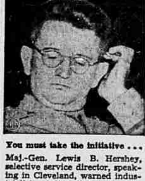
You must take the initiative ...

Maj.-Gen. Lewis B. Hershey, selective service director, speaking in Cleveland, warned industrialists of disciplinary action if they do not train replacements for workers with temporary draft deferments.