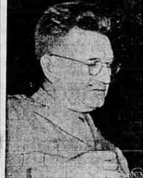
You must train replacements ...