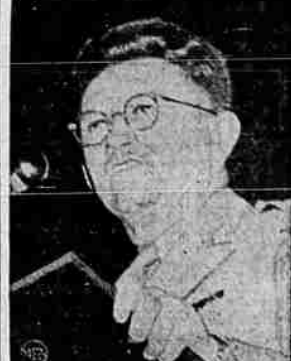
We cannot waste one man ...