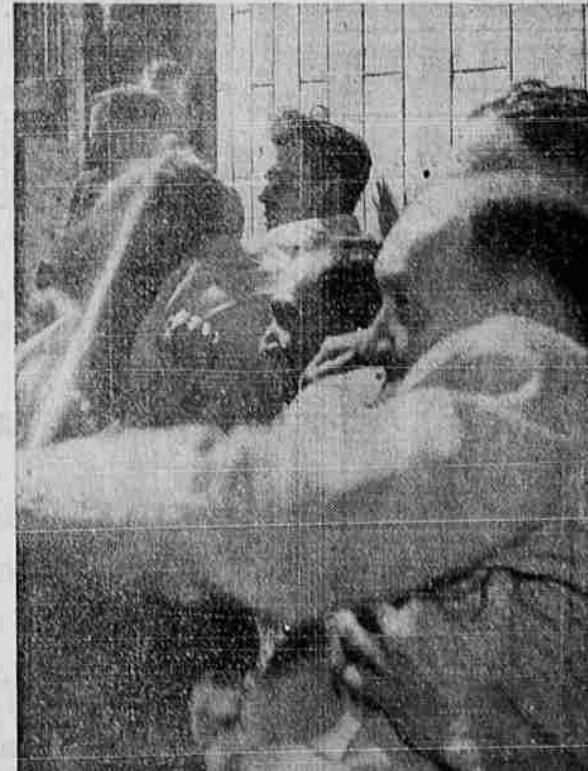
WITNESS BATTLE LINE —This quick snapshot shows Jehovah's Witness fighting men, in solid line against the back alley door at their convention hall. The Witnesses were fighting a group of irate townsmen at the time the picture was taken.