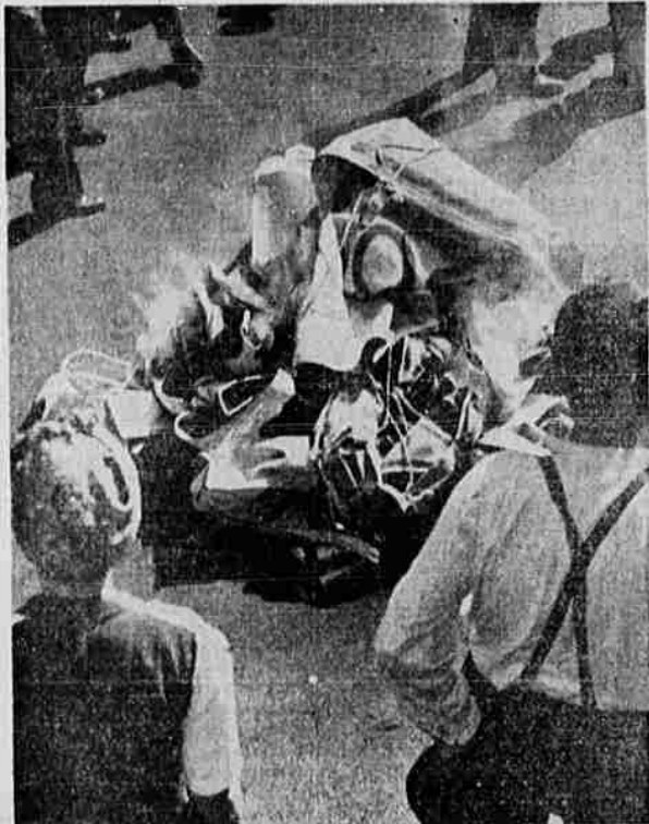
BONFIRE IN STREET —This picture shows the bonfire composed of literature and banners seized from the convention hall.