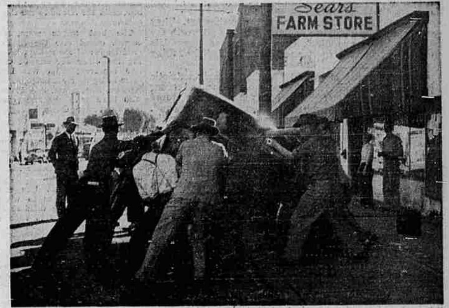
BACK ON ITS WHEELS —Jehovah's Witnesses had a strong-back crew to put overturned cars back on their wheels. The crew is shown righting a jalopie on Klamath avenue.