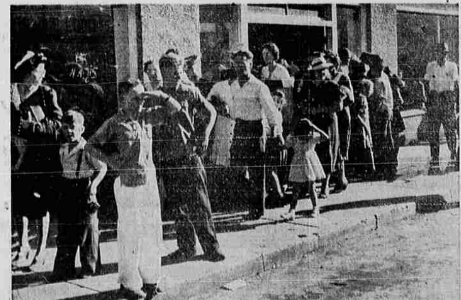
WITNESSES LEAVING HALL —Picture shows Jehovah's Witnesses trooping from the convention hall after order had been restored.