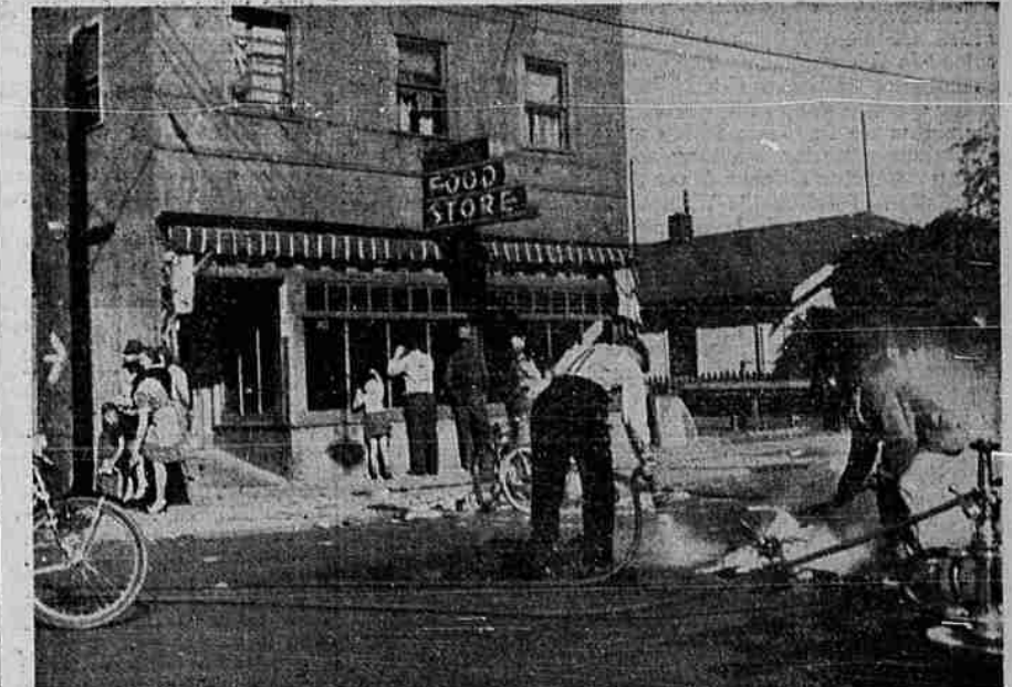
ANOTHER BONFIRE —Another bonfire was set at East Main and Holly streets, where literature and other articles from the local Witness headquarters was burned in the street.