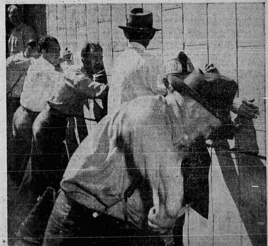
TOWNSMEN'S BATTLE LINE —Picture shows local men attempting to open a door at the back of the convention hall, after fighting had occurred in the alley. Just after the picture was taken the door opened far enough for a Witness to reach out and "conk" the man at right foreground on the head.