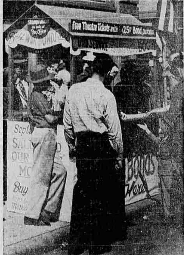
BOND SALES BOOM —A total of $1032 in bonds and stamps was sold at this booth set up opposite the Jehovah Witness convention hall. The purchases were made by townspeople—not Witnesses—in a wave of patriotic fervor.