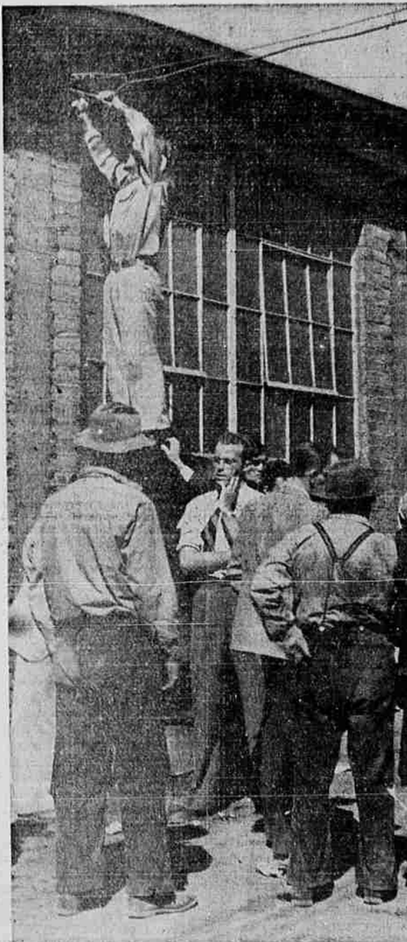
THIS STARTED SOMETHING —Trouble started in the back alley, behind the convention hall, when a citizen undertook to cut a telephone cable carrying a speech into the convention hall from a Witness leader in Ohio. Witness fighters sprang from the back door and a bloody battle ensued in which several on both sides were hurt, none seriously.