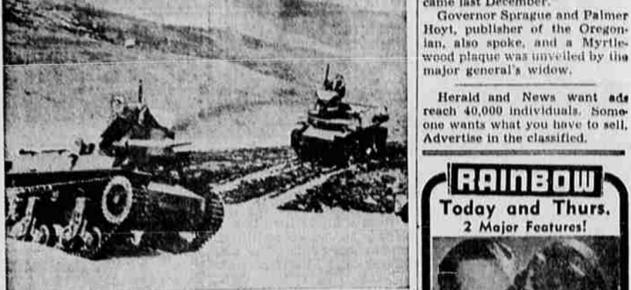
U. S. Army tanks in Alaska prove it will take more than snow-capped mountains to stop them. They are ready for the day the Japs may try to flank Dutch Harbor.