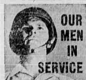
OUR MEN IN SERVICE

These filet crochet swans will smarten your guest towels or suitably edge a scarf. The simple stitchery gives you the chance to introduce the color of the room. Pattern 7322 contains a transfer pattern of 12 motifs ranging from 1 1/2 x 1 1/2 to 2 1/2 x 3 1/2 inches; chart and directions for crochet. To obtain this pattern send 11 cents in coin to The Herald and News, Household Arts Dept., Klamath Falls. Do not send this picture, but keep it and the number for reference. Be sure to wrap coin securely, as a loose coin often slips out of the envelope. Requests for patterns should read, "Send pattern No. _____, to _____ followed by your name and address.