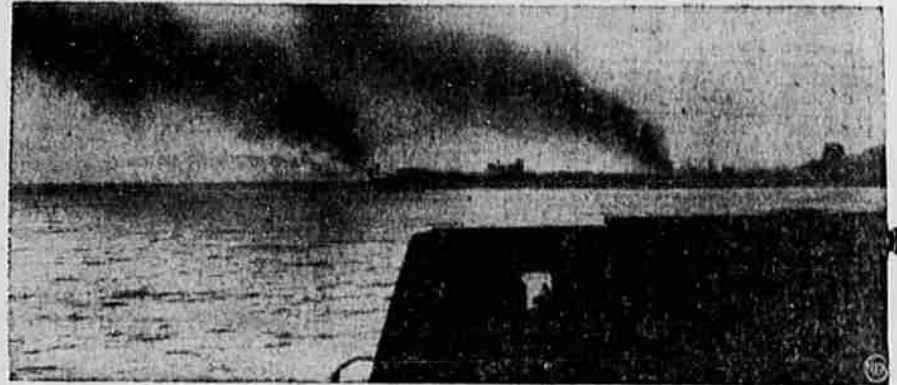
DIEPPE ABLAZE —Smoke signals the fact that their comrades have already set Dieppe ablaze as the Commandos in the invasion barge in foreground approach French coast to continue allies' greatest raid on "invasion coast."