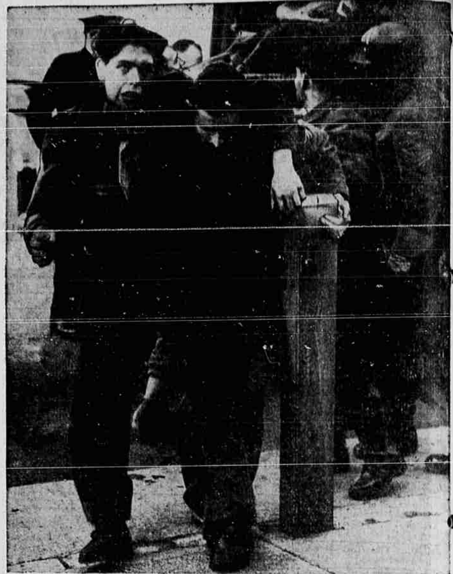
STAND-UP COURAGE —That is symbolized by this wounded Commando despite the pain which twists his face. The dramatic photo shows him being helped from ambulance at southern English port upon his return from daring allied raid on Dieppe.