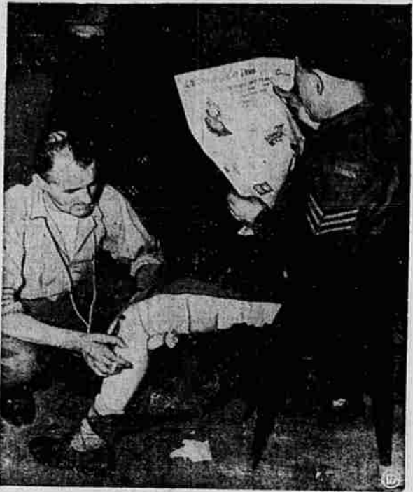
INDIFFERENT —Despite his wounded leg, a Canadian tank corps sergeant nonchalantly reads newspaper account of Dieppe raid from which he has just returned.