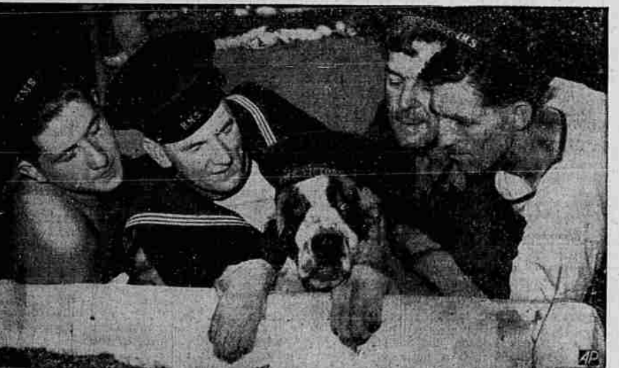
BIG FELLA —Sailors in the British naval camp in the Hudson river valley play with their puppy mascot, a St. Bernard named "Winston." Sailors rest at the camp between voyages.