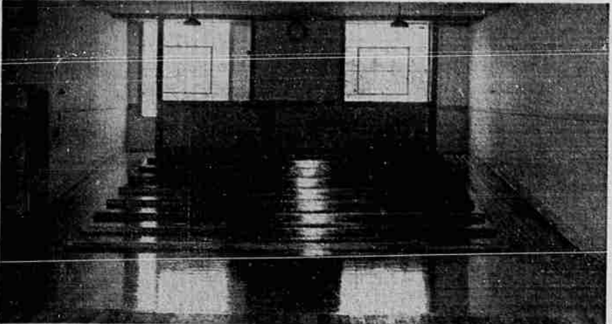
LITTLE THEATRE —View from the stage of the new Little theatre room being fitted up in Klamath Union high school building. The door opens on Mon Claire street.