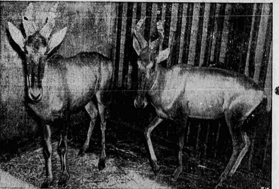
"HORNED MULES" —New arrivals at Philadelphia's zoo are these "horned mules," a pair of antelopes from Africa whose real names are Hartbeests, Boer word meaning "stag-beasts."