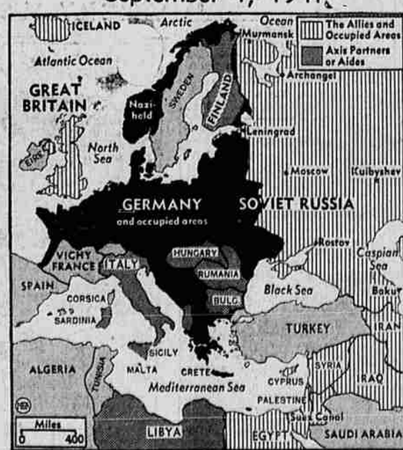
In the war's second year, Russia came in on the Allied side after invasion by Germany. Nazis overrun Balkans, but the Allies moved first to occupy Near East nations and set up a big base in Egypt.