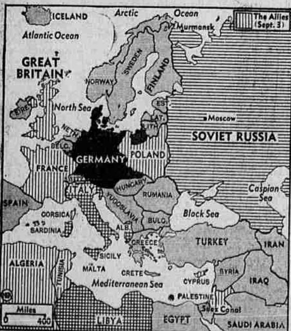
This was Europe when the German invasion of Poland started World War II. Britain and France joined the fight September 3, but the other nations of Europe remained neutral.