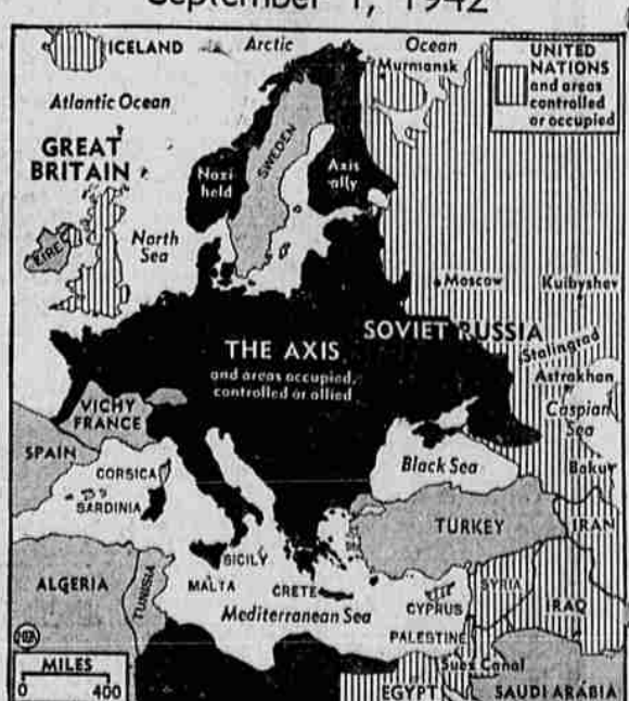
By end of war's third year, the black axis shadow covers most of Europe and European Russia, but American and British land and air forces in England may soon begin to erase it in the west.