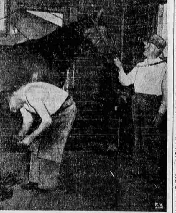
Cannon Ball, bay colt by Guy Day, gets his feet fixed up to train for the 1942 $40,000 Hamiltonian stake...

Can't Lose Lou Novikoff has hit ball from town to town since Philip K. Wrigley gave him bonus for striking out swinging.