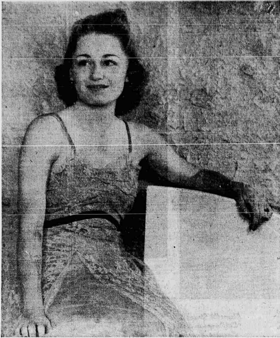
BRIDE IN LOUISVILLE