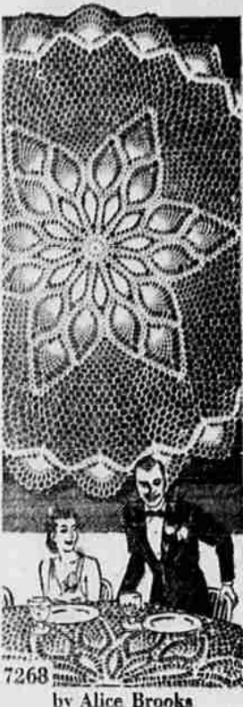
7268 by Alice Brooks

You'll want to get started at once on this lovely pineapple cloth—so rich-looking and yet so easy to crochet. You can make it in various sizes. Pattern 7868 contains instructions for cloth in various sizes; illustrations of it and stitches; materials needed.