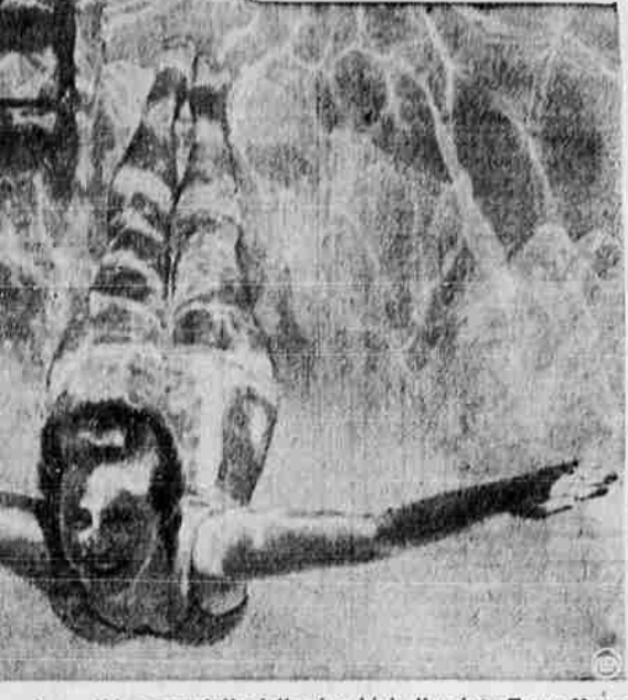
Marjorie Gestring, national champion, glides gracefully following high dive into Town House pool, Los Angeles. Picture was taken from under-water gallery.