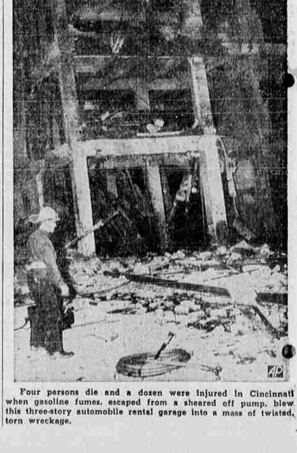
Four persons die and a dozen were injured in Cincinnati when gasoline fumes, escaped from a sheared off pump, blew this three-story automobile rental garage into a mass of twisted, torn wreckage.