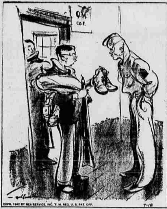
"I wonder what we're supposed to do—shoot the enemy or trample them to death!"