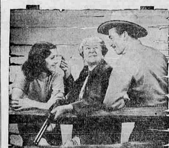
Ellen Drew, May Robson and John Howard, who are to be seen tomorrow at the Tower theatre in "The Texas Rangers Ride Again"; a second hit features Melvyn Douglas and Joan Blondell in "Good Girls Go to Paris."