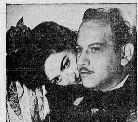
Tender romance to remember in Columbia's "They All Kissed the Bride," which stars Joan Crawford and Melvyn Douglas at the Esquire theatre starting with tonight's midnight prelude. Alexander Hall directed the new love-and-laugh-fest, whose cast also includes Roland Young, Billie Burke and Allen Jenkins.