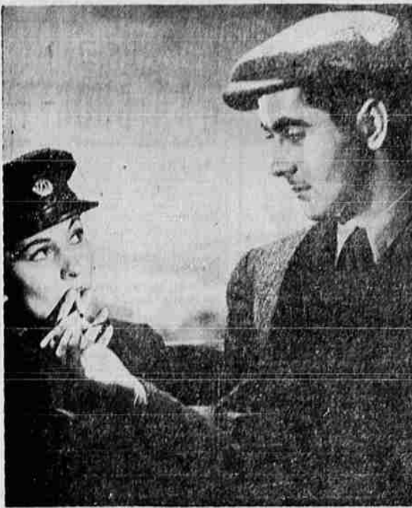
The gripping story of a man and a girl groping for love in a world where only the touch of their lips seemed real is unfolded by stars Tyrone Power and Joan Fontaine in Eric Knight's great novel, "This Above All," now at the Pelican theatre.