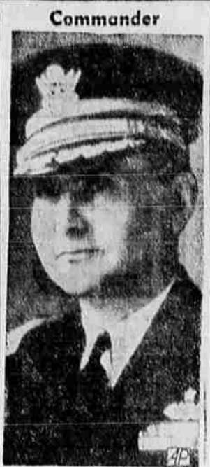
Brig. Gen. Ira C. Eaker, Llano county, Tex., was disclosed to be the commander-in-chief of the bomber command of the U. S. army air forces in the European theatre of operations.

After the ship sank, the sub surfaced and its commander questioned crew members on the name of the ship and its cargo. The sub commander pointed out two crew members swimming in the sea before submerging.