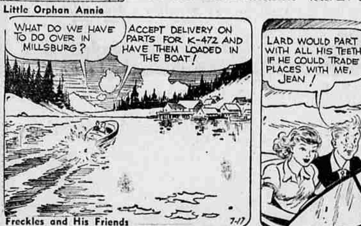
Freckles and His Friends