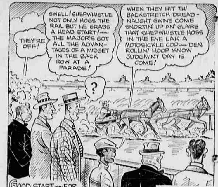
GOOD START—FOR ALL BUT HOOPLE