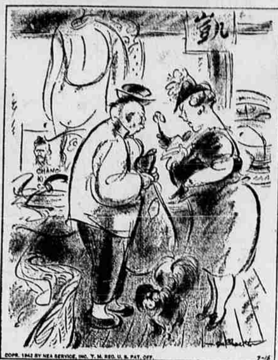
"I'm bringing you my laundry as my contribution for aid to China—but see that you don't overcharge me!"