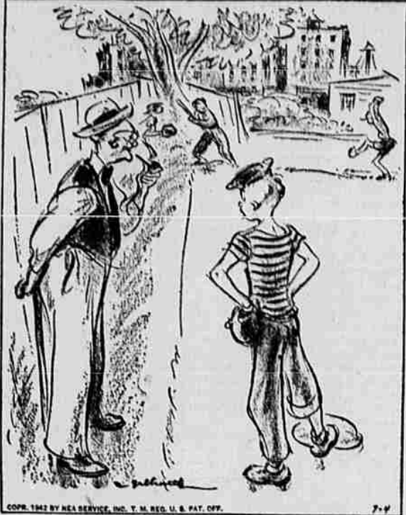
"His curve ain't so hot, but we always let him pitch—his dad's a bomber captain in Australia!"

than any other class. A few big ones, handling large contracts, have profited enormously, however.