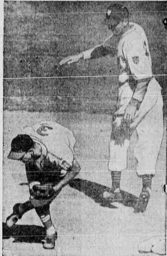
Conga-fashion, Jimmy Brown of St. Louis Cardinals goes into a fine bit of interpretive dancing around second base as Carl Hubbell of New York Giants, just forced, apparently takes part.