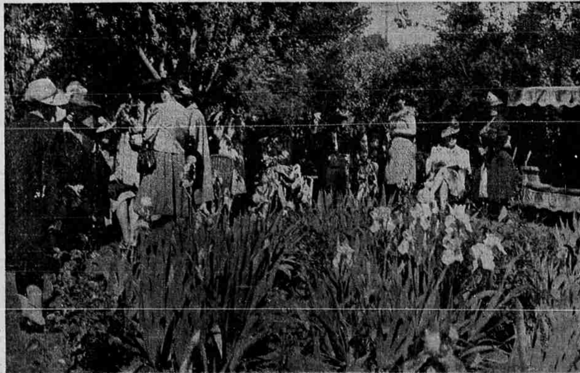
A FEW OF THE GUESTS at the garden party last week with a lovely bed of interesting iris in the foreground.