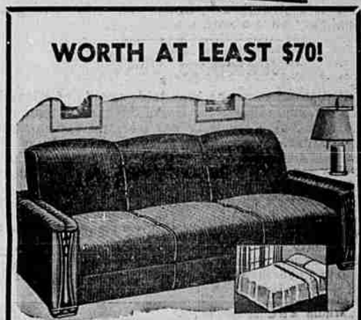
WORTH AT LEAST $70!