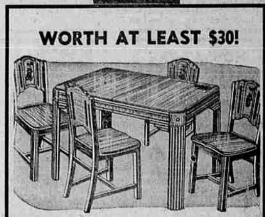
WORTH AT LEAST $30!