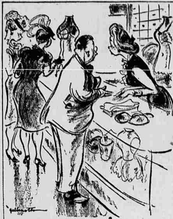
"I want an anniversary present for my wife! Have you anything attractive in the way of overalls or something for a truck driver?"

is every reason to hope he cannot go on into Egypt to break the grasp of the united nations on the middle east before fall—and things may be different for our side there by fall. If he can find more soft spots, he might try to crash through, but the British are apparently not demoralized.