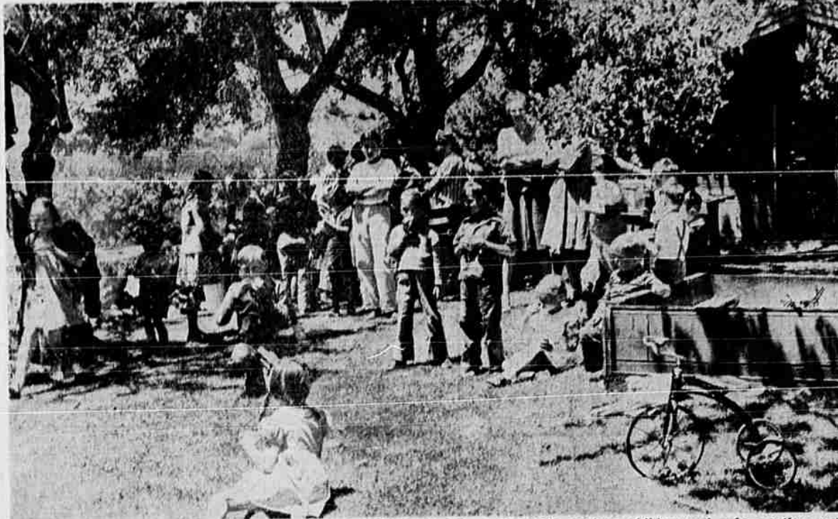
Following a two weeks' church school conducted at St. Paul's Episcopal church, teachers, children and a few mothers gathered for a picnic lunch at the H. P. Bosworth home on Conger avenue. Hot dogs were roasted over an open fire on The Big Lawn and "a good time was had by all."

many-hued glimpses of nature's garb in the land of the "Midnight Sun." The colors of the rainbow are depicted in the scenes that are shown in this reel.