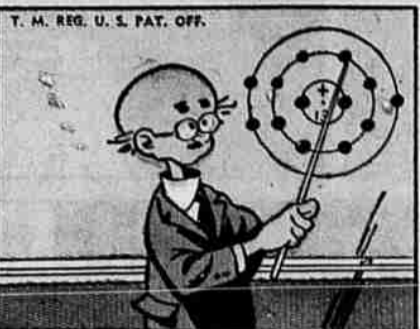
T. M. REG. U. S. PAT. OFF. THE MENTAL GIANT IS LIKELY TO BE AN INSIGNIFICANT LOOKING LITTLE CHAP.