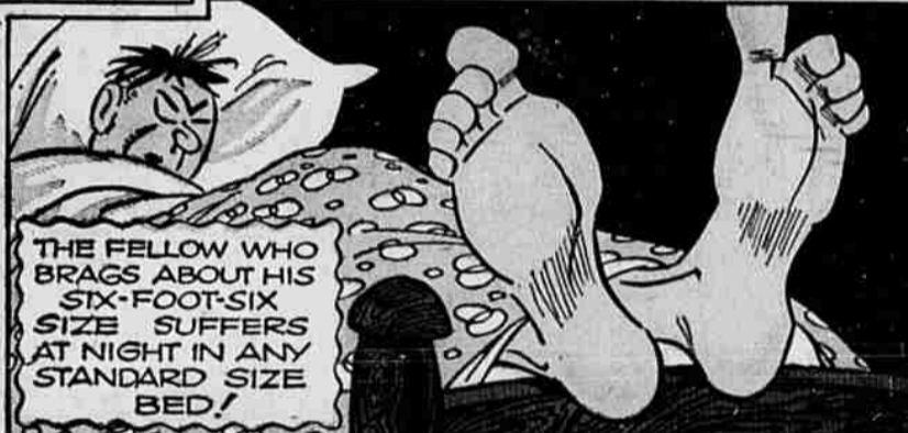
THE FELLOW WHO BRAGS ABOUT HIS SIX-FOOT-SIX SIZE SUFFERS AT NIGHT IN ANY STANDARD SIZE BED!