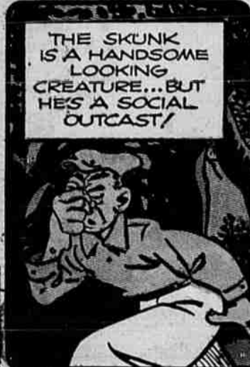
THE SKUNK IS A HANDSOME LOOKING CREATURE... BUT HE'S A SOCIAL OUTCAST!