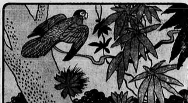
TROPICAL BIRDS WEAR THE WORLD'S MOST GORGEOUS PLUMAGE... BUT THEIR VOICES ARE SHRILL AND RASPING. 6-14