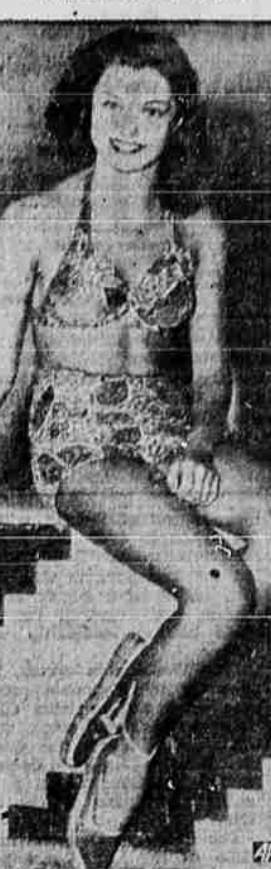
Ester Williams (above), former national women's 100-yard free style swimming champion, has embarked on a movie career at Metro-Goldwyn-Mayer studio at Hollywood, where her first big role will be that of Mickey Rooney's latest girl friend.