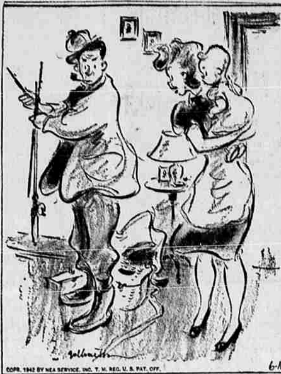
"The office called and said not to worry about a thing during your vacation—your substitute just swung that big deal you've been working on for three years!"

ing peace at home, we will first need a domestic police force of the biggest army, the strongest navy and the best air force in the world.