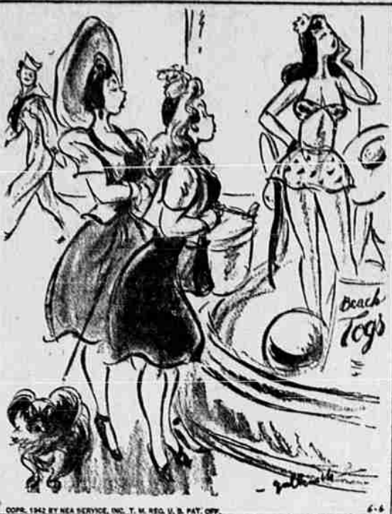
"My advice would be to buy one bathing suit if you take that style—who'll notice the suit anyway?"