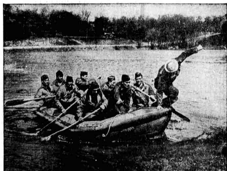
SOLDIERS TEST LANDING CRAFT —United States army soldiers do a practice landing operation on a lake to test a 10-man rubber landing boat. Boats are inflated with carbon dioxide.