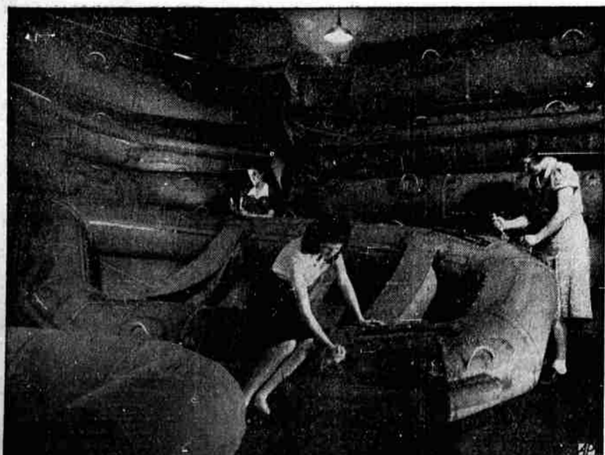
WOMEN TURN OUT LANDING BOATS —Women are employed to make 10-man rubber Firestone landing boats. The boat can be inflated from a carbon dioxide tank built into its side.