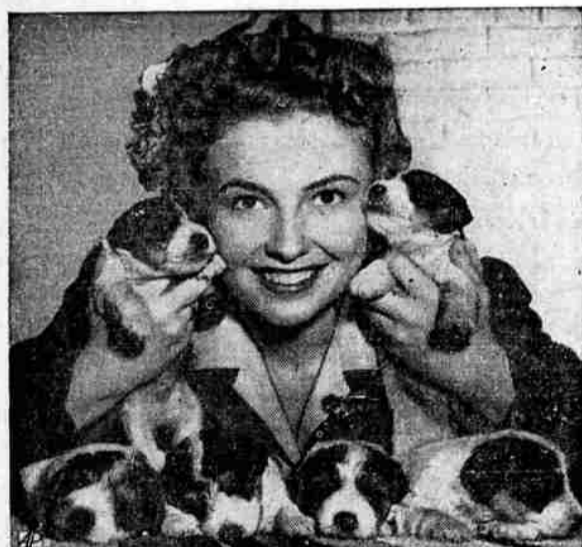
OFFERS MASCOT —Film Actress Joan Leslie has offered one of these puppies to any fighting unit without a mascot.