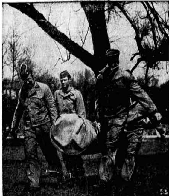
CARRYING RUBBER BOAT —U. S. soldiers carry rubber landing boat which when inflated will carry 10 men.