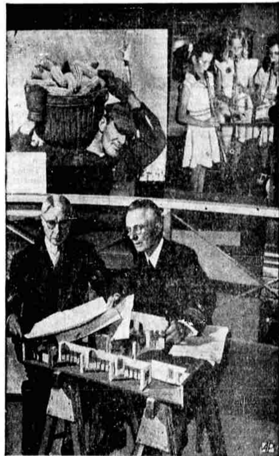
POET WORKS ON EXHIBIT —Carl Sandburg (left), poet and biographer, and Lt. Comdr. Edward Steichen, U.S.N.R., study a model while arranging mural-size photographs at an exhibit in New York. Steichen assembled photographs and Sandburg is writing accompanying text.