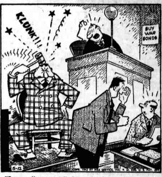
"So my client can tell the truth when he says 'I don't remember.'"