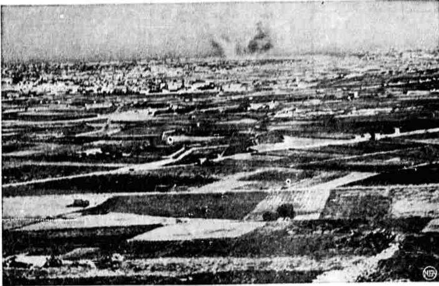
Smoke from axis bombs rises over Malta, probably the most bombed place of the war, with more than 2000 air raids on the tiny British island in the Mediterranean.