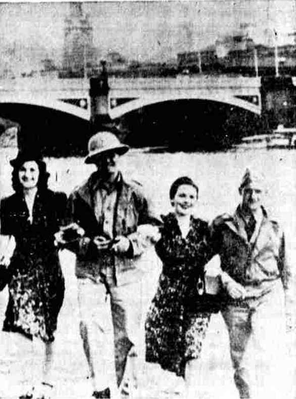
Among first original pictures to arrive in the United States since A. E. F. forces arrived "Down Under," was this of two American fighting men and Australian girls strolling along banks of the Yarra Princess Bridge with Melbourne in the background. They seem to be enjoying themselves.