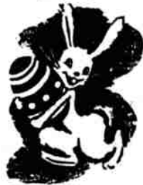
Easter's Coming April 5th

See Shaw's Shelves By the way, if you're in the mood to browse through books before you buy, Shaw's is an excellent place to do it.