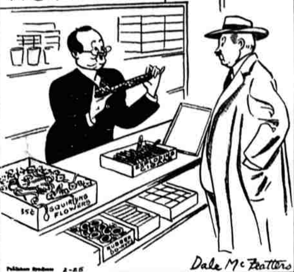
"It explodes with a terrific roar, leaving your victim smiling sheepishly in a huge crater!"