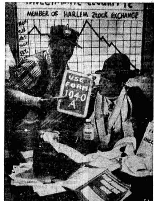
ADDS UP —When that radio braggart, Andy, got too involved in income tax, Amos came along with advice straight from the U. S. treasury: Use 1040A, an optional, simplified form handy for persons with gross income less than $5,000.