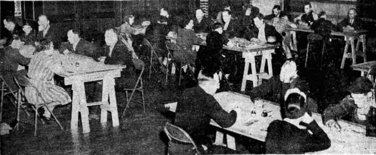
THIRD DRAFT REGISTRATION —This general view was taken at the Klamath armory Monday, when hundreds of Klamath men signed up in the third selective service registration.