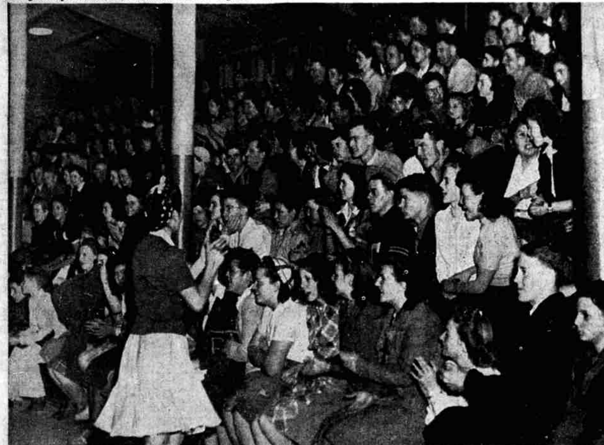
HIGH SCHOOL ANIMATION —Partisanship was intense Friday night in the Altamont gym as students from Klamath and Lake county B high schools packed the arena to watch their teams in action in the championship cage tournament. Above, the Chiloquin rooting section during a cheer.