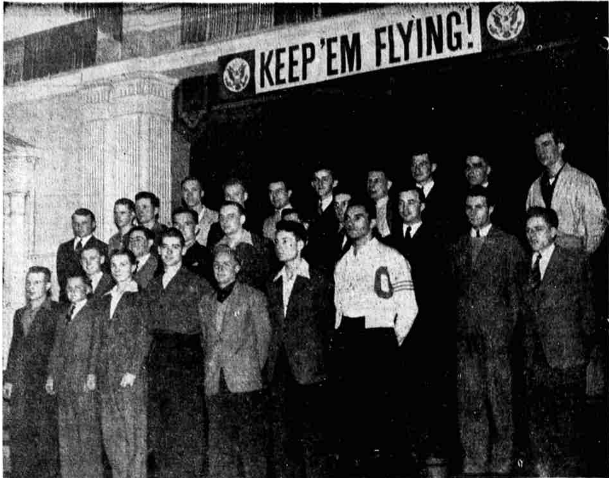
AVIATION CADET CANDIDATES HONORED —Forty applicants for aviation cadet training were paid special honors at a meeting of the Klamath Falls Elks lodge Thursday evening. The group is shown above in the lodge hall. It was a feature of "Keep 'Em Flying" week.