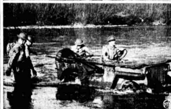
Next logical development in the "Jeep" line will be to make the durned things fly. Here, "somewhere in the Pacific Northwest," Uncle Sam's soldiers convert the motor-driven road vehicle into a water "Jeep" merely by wrapping the lower part of the car in canvas and poling it out into the river.