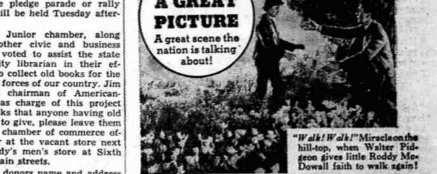
"Walk! Walk!" Miracle on the hill-top, when Walter Pidgeon gives little Roddy McDonald faith to walk again!