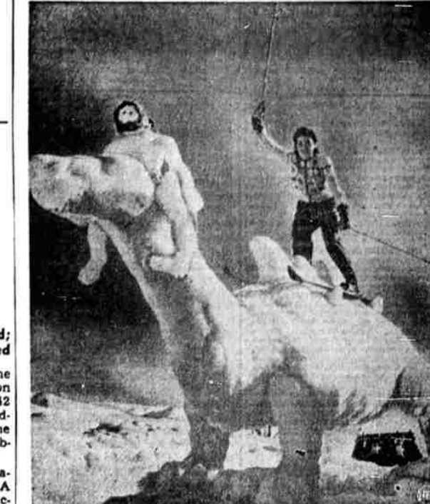
If a pretty skier asked for a lift, you couldn't refuse her, could you? Neither could Alley Oop and Dinny the Dinosaur. Famous comic figures are sculptured in snow at Sun Valley, Ida.